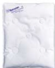
THERMOFORM Ice Compress 24 x 32 cm # 1120