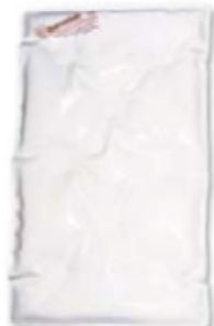
THERMOFORM Paraffin Compress 24 x 42 cm # 1030