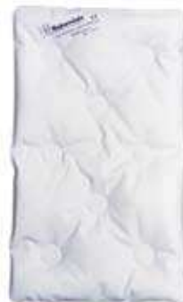
THERMOFORM Ice Compress 24 x 42 cm # 1130