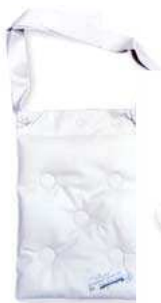
THERMOFORM Ice Compress with 2 tapes for the treatment of arms 24 x 32 cm # 1160