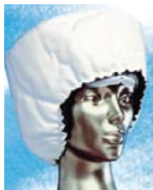
THERMOFORM IceCap Set with Velcro tape and insulation hood # 1180

The THERMOFORM IceCaps are ideally adapted to the patient's anatomical features and come in all head sizes.