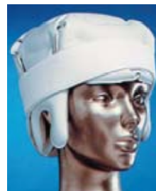
THERMOFORM IceCap with Velcro tape # 1181