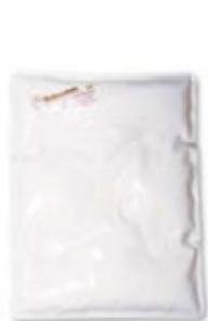
THERMOFORM Paraffin Compress 24 x 32 cm # 1020