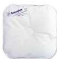
THERMOFORM Ice Compress 22 x 22 cm # 1110