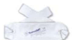
THERMOFORM Ice Collar with 2 tapes for the neck and joints, for children 7 x 25 cm # 1150