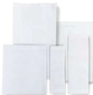
THERMOFORM Covers (white) for Ice Compress 1110 # 1401 for Ice Compress 1120, 1160 # 1402 for Ice Compress 1130 # 1403 for Ice Compress 1140 # 1404