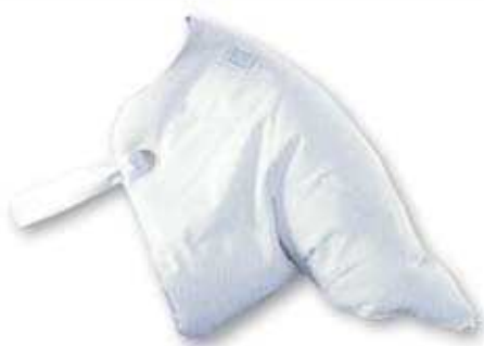
THERMOFORM Shoulder Ice Compress with tapes # 1190