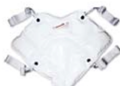
THERMOFORM Paraffin Compress with 4 tapes for the shoulder area # 1050