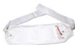
THERMOFORM Paraffin Compress with 2 tapes for the neck and joints 10 x 30 cm # 1040