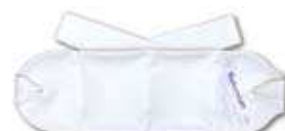
THERMOFORM Ice Collar with 2 tapes for the neck and joints, for adults 10 x 30 cm # 1140