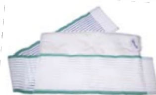
THERMOFORM Retention bandages for ice compresses 60 x 7,5 cm # 1301 70 x 7,5 cm # 1302 90 x 7,5 cm # 1303 120 x 15 cm # 1304 100 x 11 cm # 1305 (with pocket as shown)